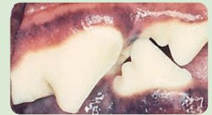
Figure 1: Healthy mouth