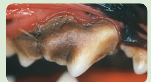
Figure 3: Periodontitis with very inflamed and receding gums