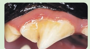
Figure 2: Gingivitis with early calculus